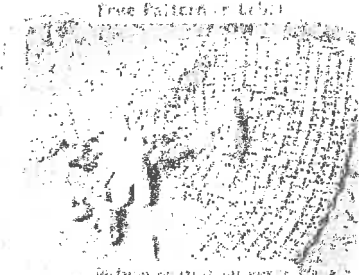
Pattern available on www.bernat.com Patrón disponible en www.bernat.com

BERNAT P.O. Box 40, Hatfield, Ont. M4W 3B8 www.bernat.com